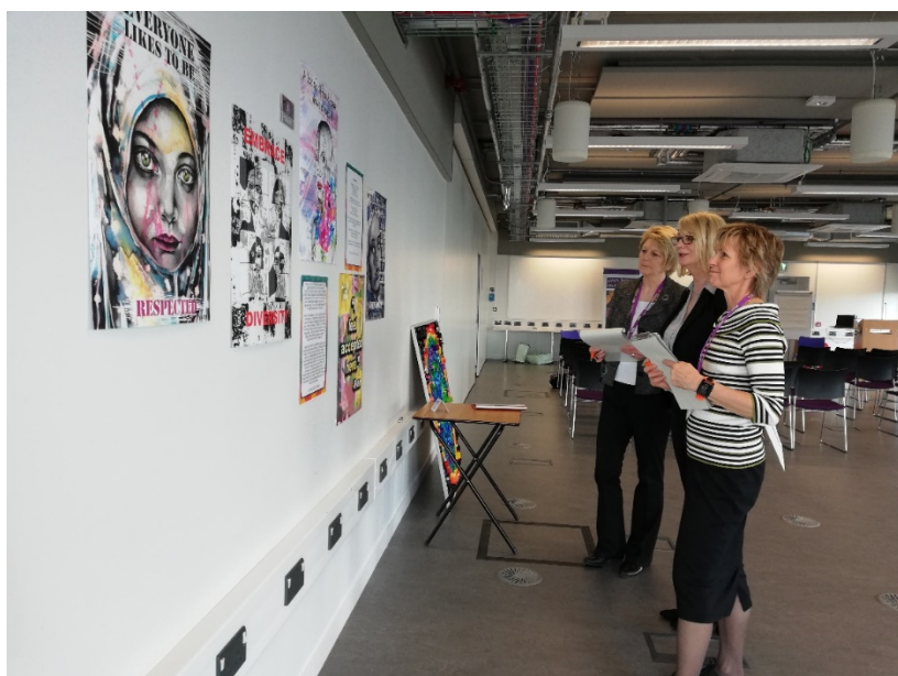
Glasgow Colleges' Regional Board reviewing work at our Regional Diversity competition

Our regional Embracing Diversity Competition encouraged students from across the college region to reflect on what Equality, Diversity and Inclusion means to them. Students across the region were asked to use their creativity and learning to communicate the values of fairness, opportunity and respect, with the winning entries emphasising the scope and diversity of learning in Glasgow's colleges.