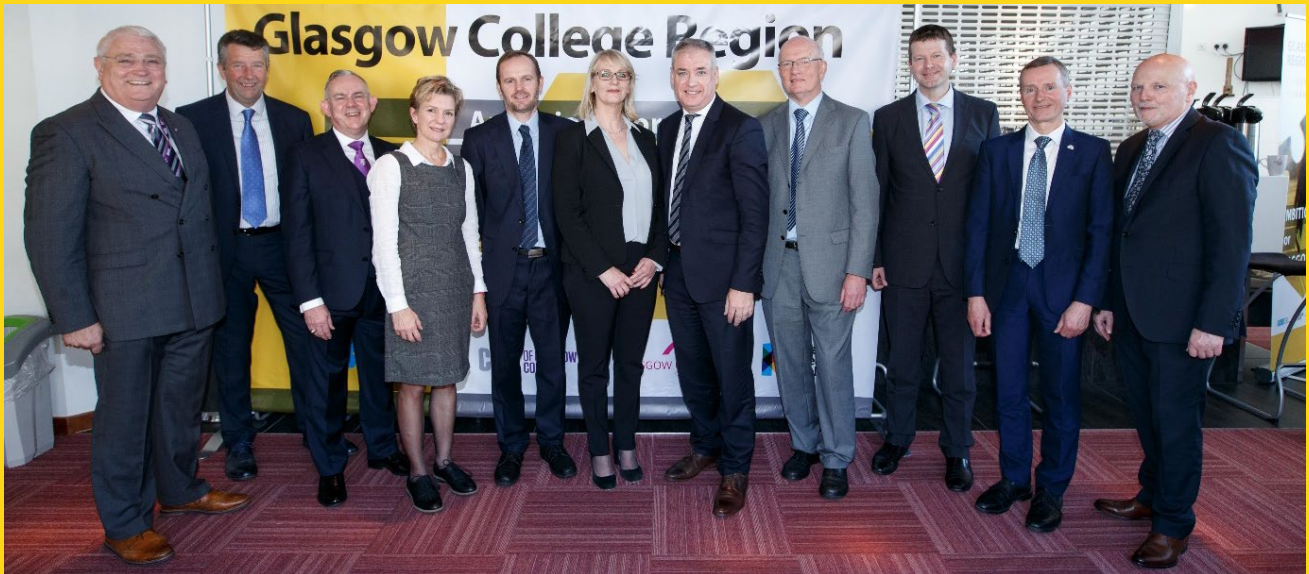
Minister for Further Education, Higher Education and Science Richard Lochhead meets with Glasgow College Region Board members and senior staff