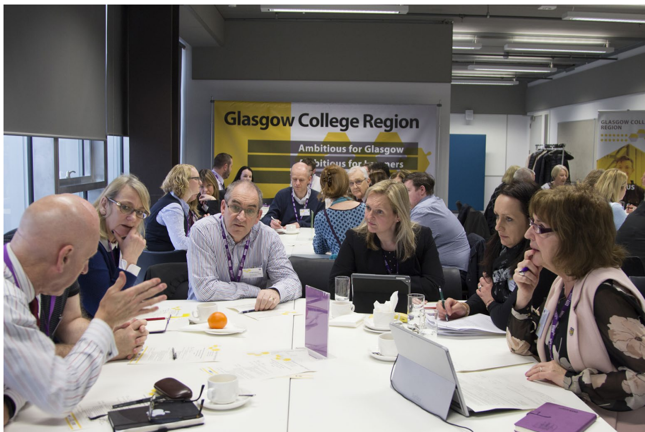
Regional Board members, staff, students and stakeholders at a regional conversation event

College and regional board members are now collaborating on key governance issues, including risk management, GDPR, cyber-security and increasing diversity on boards.