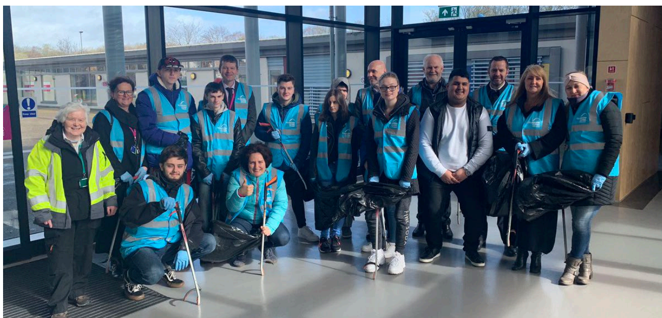
Glasgow Colleges' Regional Student Executive organised Clean Campus Week across the Glasgow colleges

GCRB also engages with Student Associations through the Glasgow College Region Student Executive (GCRSE) group, which meets on a bi-monthly basis and coordinates regional activity across all three Students Associations. For example in 2018-19, the Glasgow Colleges' Regional Student Executive hosted Clean Campus Week in March across all of our colleges, aiming to clear the grounds, raise awareness of recycling facilities and keeping campuses tidy on an ongoing basis. The collaborative initiative saw groups of students and staff giving up their lunchtime to roll up their sleeves and pick up litter around campus and college students hosted a dedicated information session with advice on recycling and waste management.