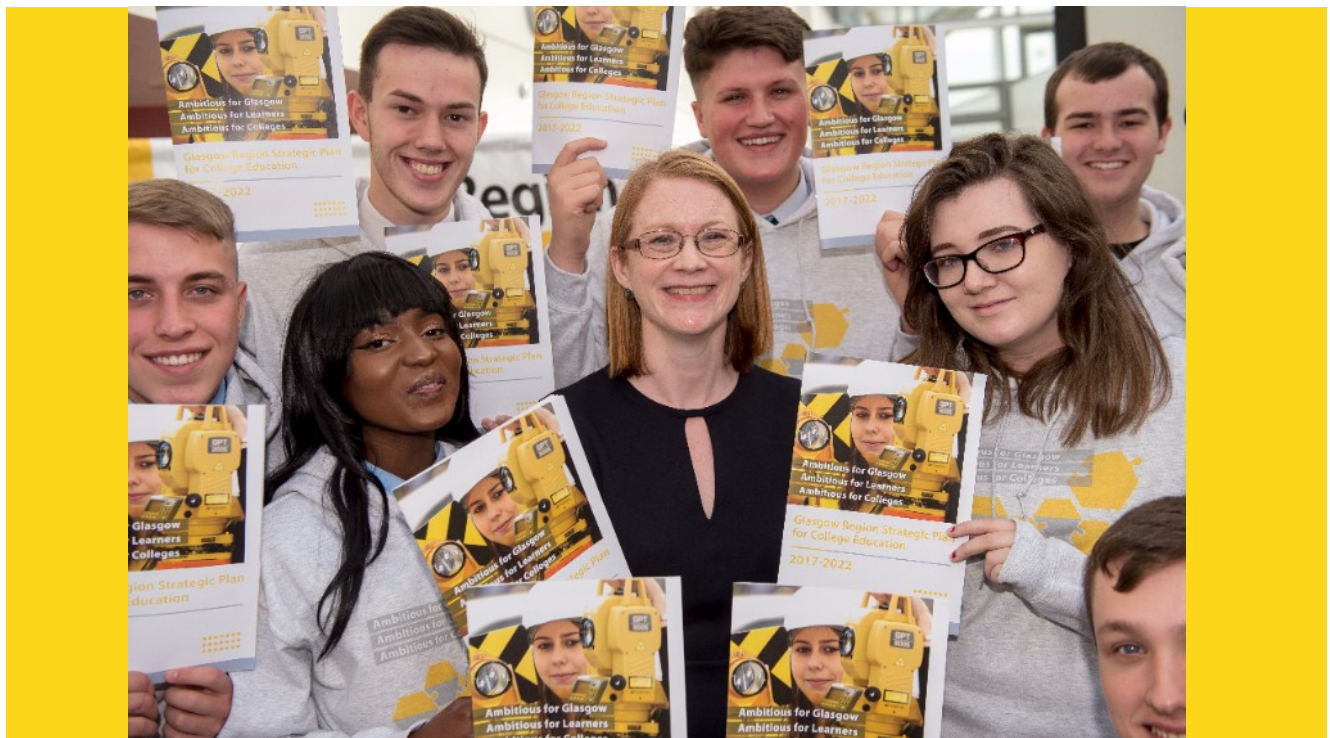
In 2017, Glasgow Colleges' Regional Board launched a five year Regional Strategic Plan for college education