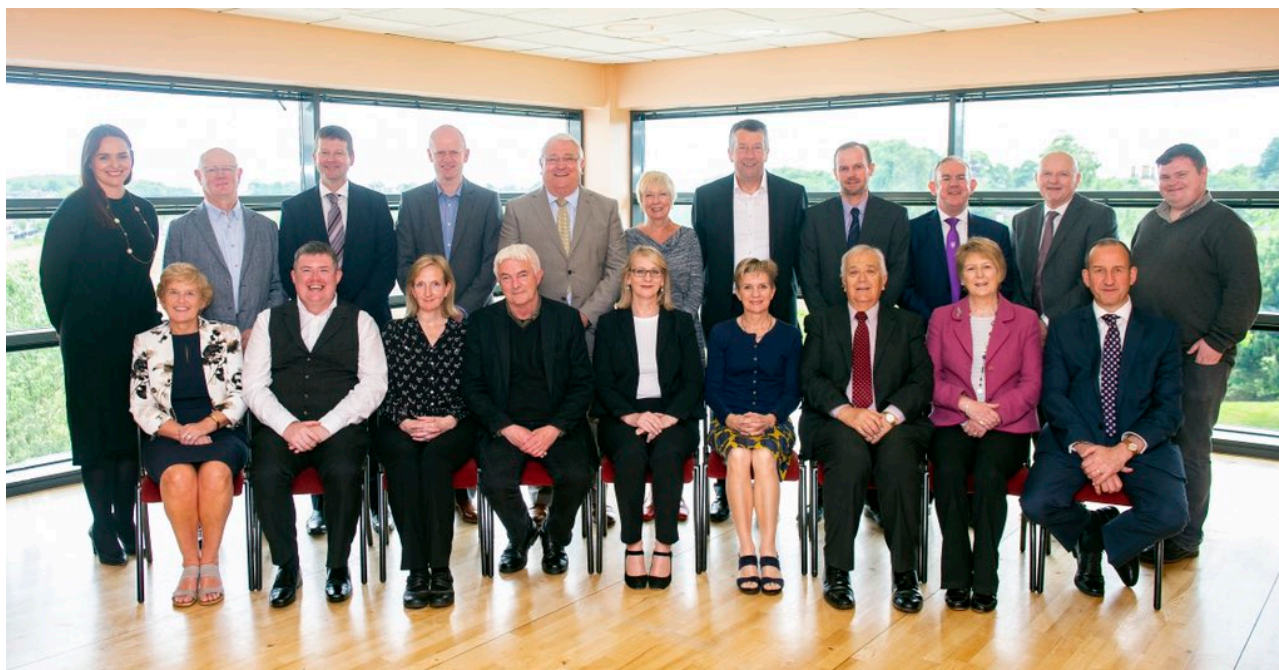
The Glasgow Colleges Regional Board includes representation from college Boards, staff and students