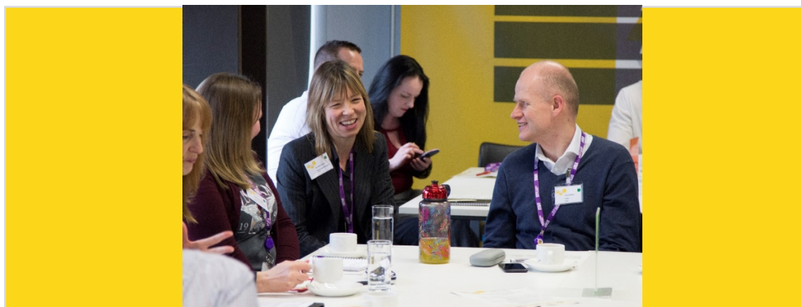
Discussing Mental Health at a regional conversation event

The first 'regional conversation' was held in September 2018, with 44 people attending overall, including 26 Board Members and 15 members of staff. The event focused on diversity and considered ways the 4 boards could collaborate on initiatives to improve their diversity.