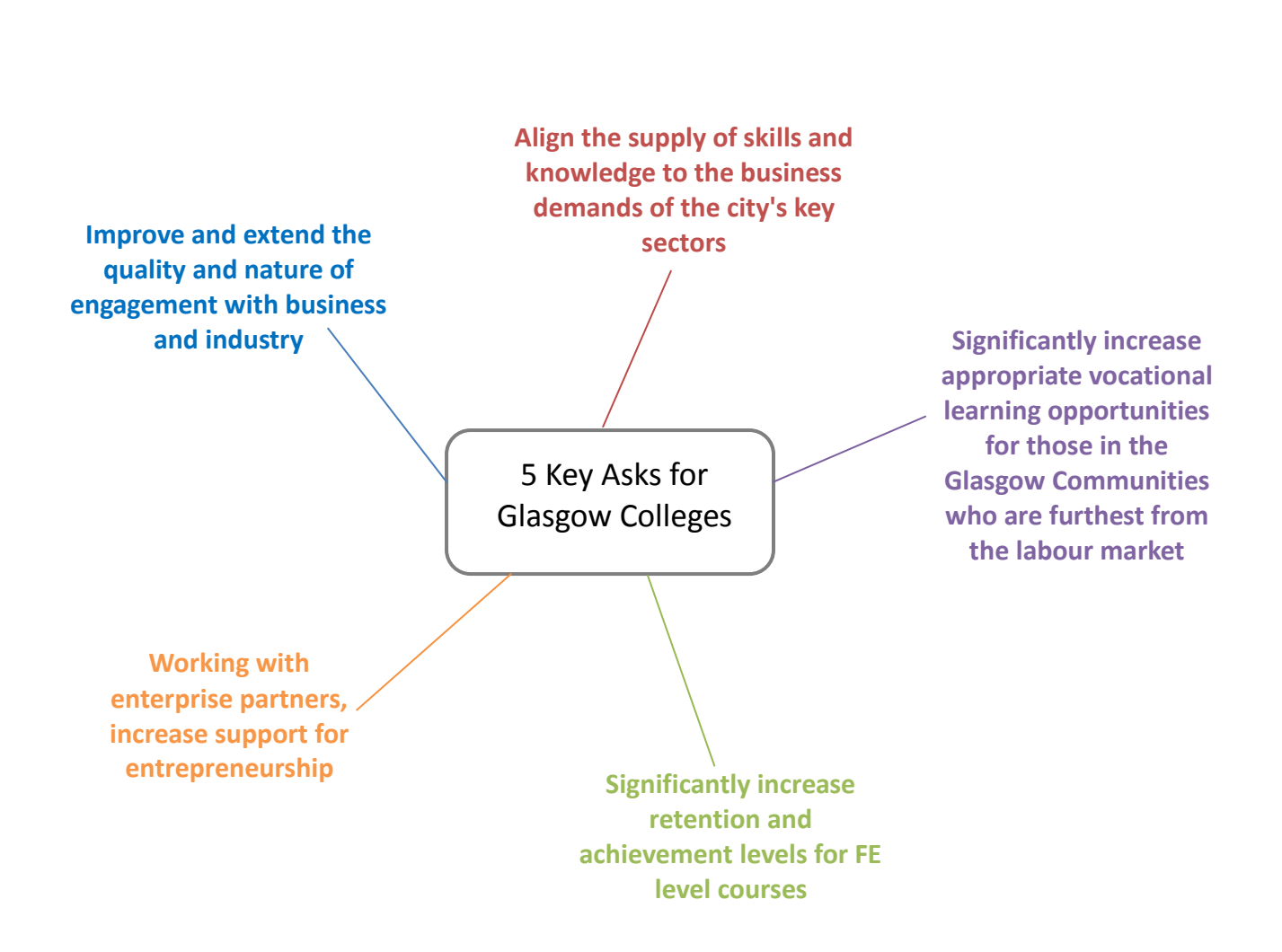
Figure 1. Summary of Key Asks for Glasgow Colleges

Underpinning this plan has been extensive research into the environmental aspects highlighted above, to clearly identify regional college stakeholder needs. This review analysed the requests of Government, local authorities, economic development agencies, employers, secondary schools and community partners. The results have been distilled and may be summarised as follows: